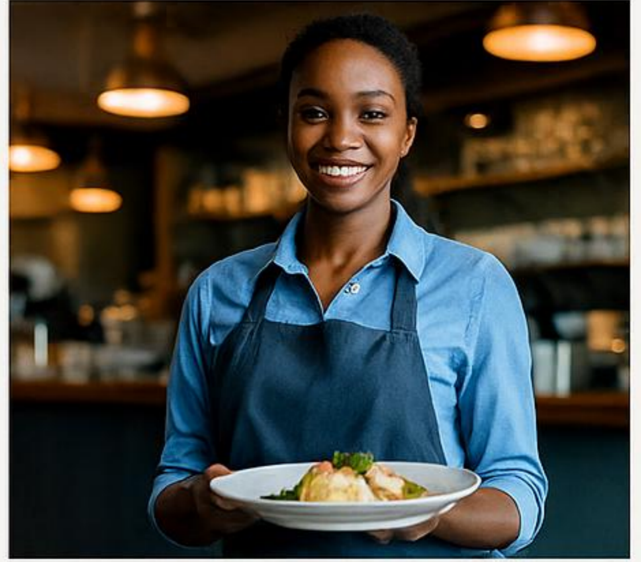
RESTAURANT / F&B