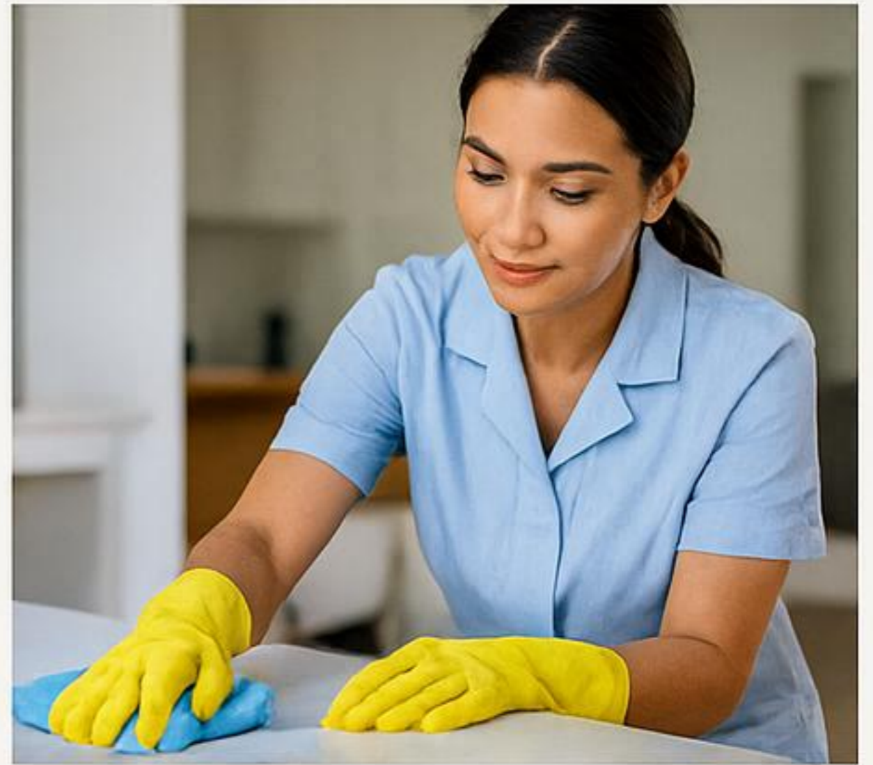
CLEANING / HOUSEKEEPING